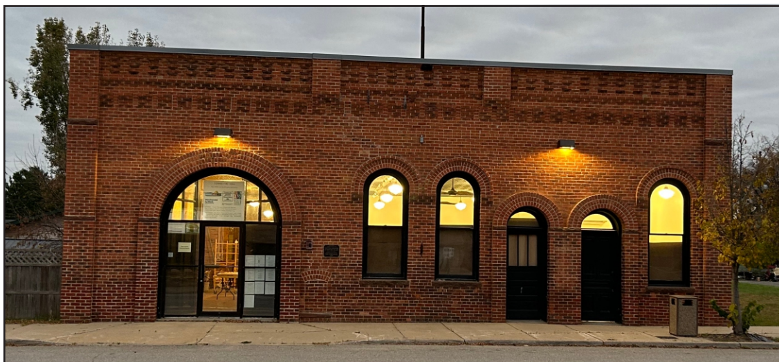
The Tower Fire Hall Restoration Project is nearing completion.

TOWERSOUDANHISTORY.COM • TOWERSOUDANHSGMAIL.COM