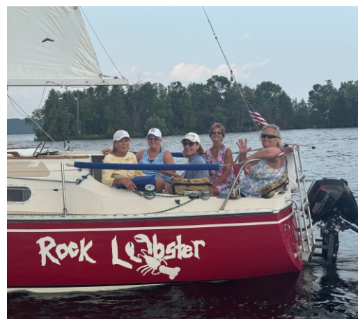
2025 Rock Lobster Cruise winners.

We have the good fortune of enjoying this magnificent lake and it will live on long after us. Let’s keep telling its story. Come and help preserve our heritage while enjoying a wonderful afternoon with your neighbors and maybe make some new friends. We look forward to seeing you there!